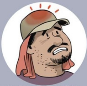
DOLOR DE CABEZA