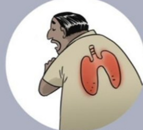
DIFICULTAD AL RESPIRAR