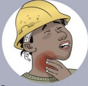
DOLOR DE GARGANTA